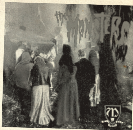
Jungle Noise, LP, 1995