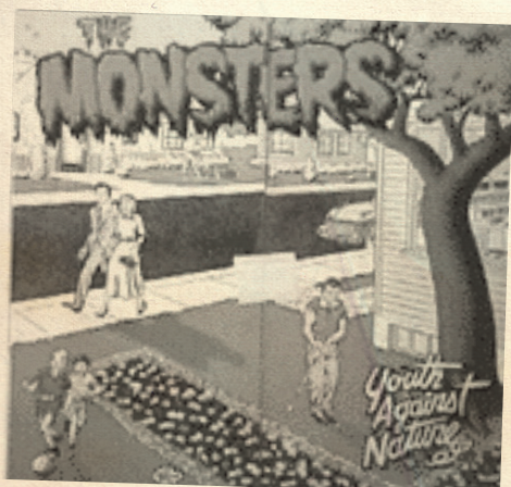
Youth Against Nature, LP, 1998