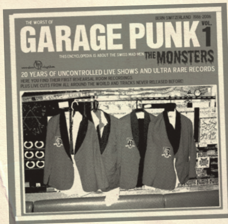
Garage Punk, LP, 2006