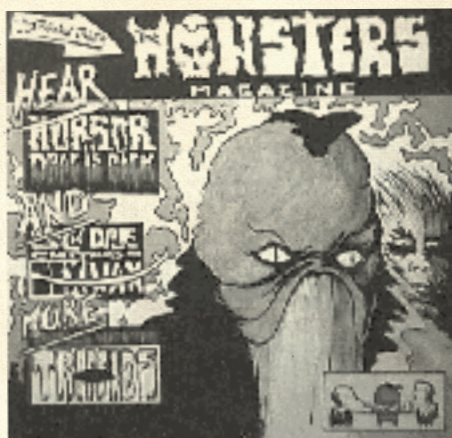
The Hunch, LP, 1992