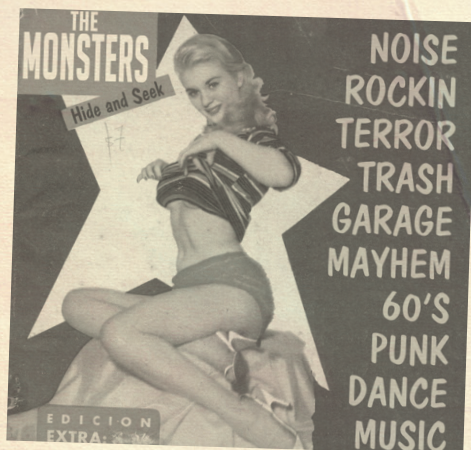
Hide And Seek, LP, 2005