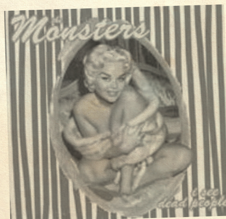
I See Dead People, LP, 2002