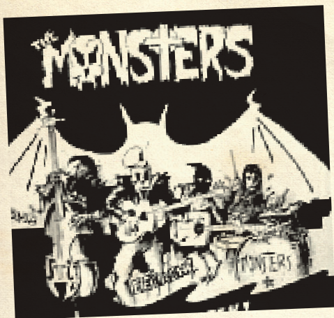
Masks, LP, 1989