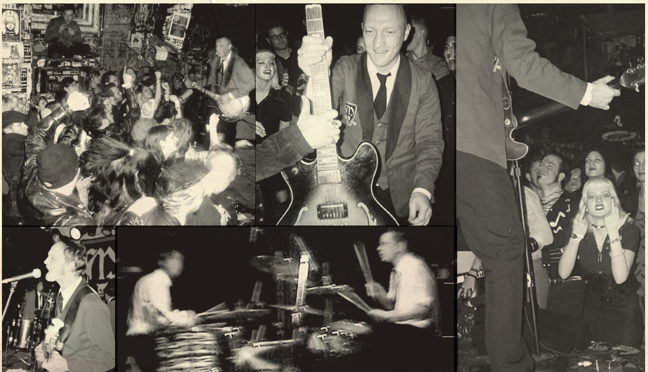
Live at CBGB's