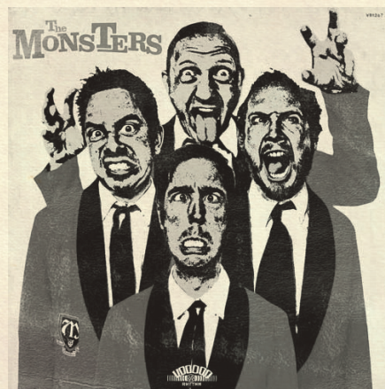
Pop Up Yours, LP, 2011